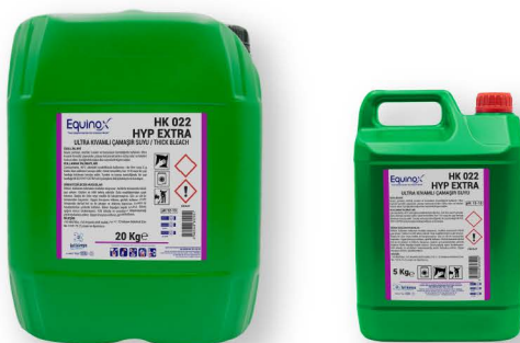
HK 022 HYP EXTRA Ultra Thick Bleach

Weight : 5 kg Package : 4 x 5 kg pH : 12-13